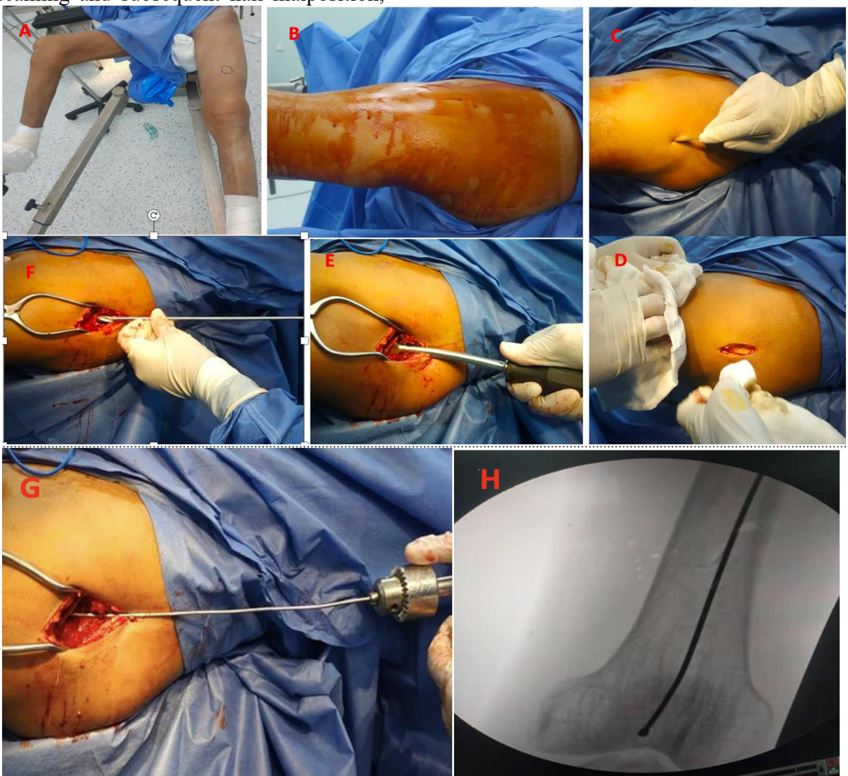
Fig.1. Antegrade nailing insertion techniques; (A) supine position, (B) scraping with betadine, (C) site of skin incision (D)deep fascia dissection, (E) insertion of awl, (F) rigid reamer, (G) guide wire and (H) X-ray of guide wire

Unreamed nails were used for fractures with undisplaced butterfly fragments, with a nail size of 10mm. For reamed nails, the size was determined by the last reamer used, minus 1mm, ( Fig.1 ).