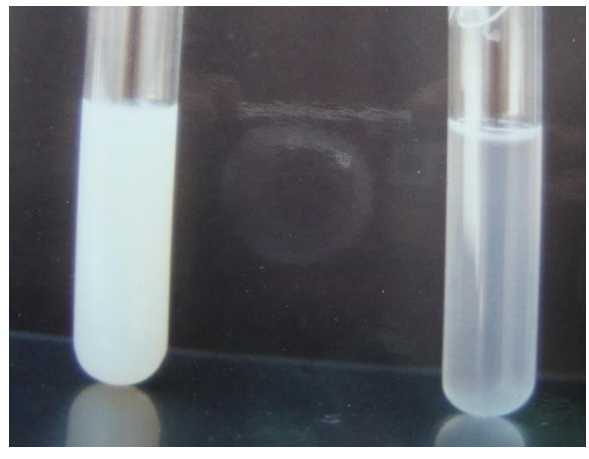
Fig.1. Chyle sample- Chyluria (left) and Chylothorax(right)

The research followed the tenets of the Declaration of Helsinki. Informed consent was obtained from the subjects